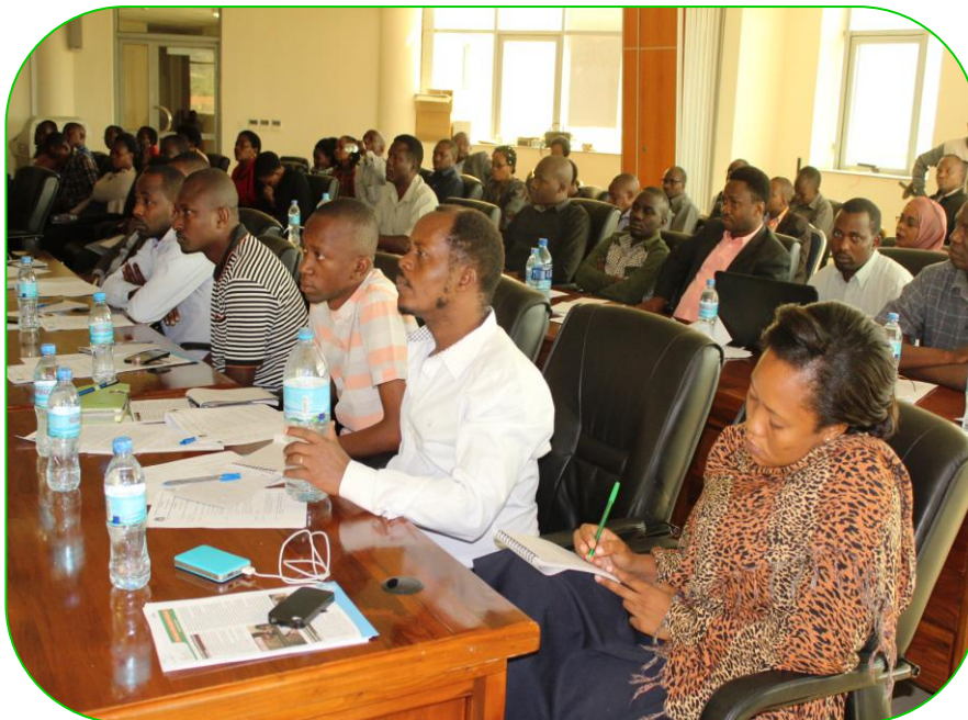
Stakeholders at the fifth workshop on assessing data gap for Five Year Development Plan and Sustainable Development Goals (SDGs) under the theme make cities and Human Settlements Inclusive, Safe, Resilient and Sustainable held in Dodoma at CAG conference Hall recently.