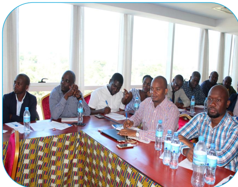
Part of NBS staff from regional offices attending recently held meeting held in Dodoma.

The NBS chief called for continued support to all stakeholders including the media and urged RSMs to work closely with offices of regional commissioners so as to support data collection and dissemination.