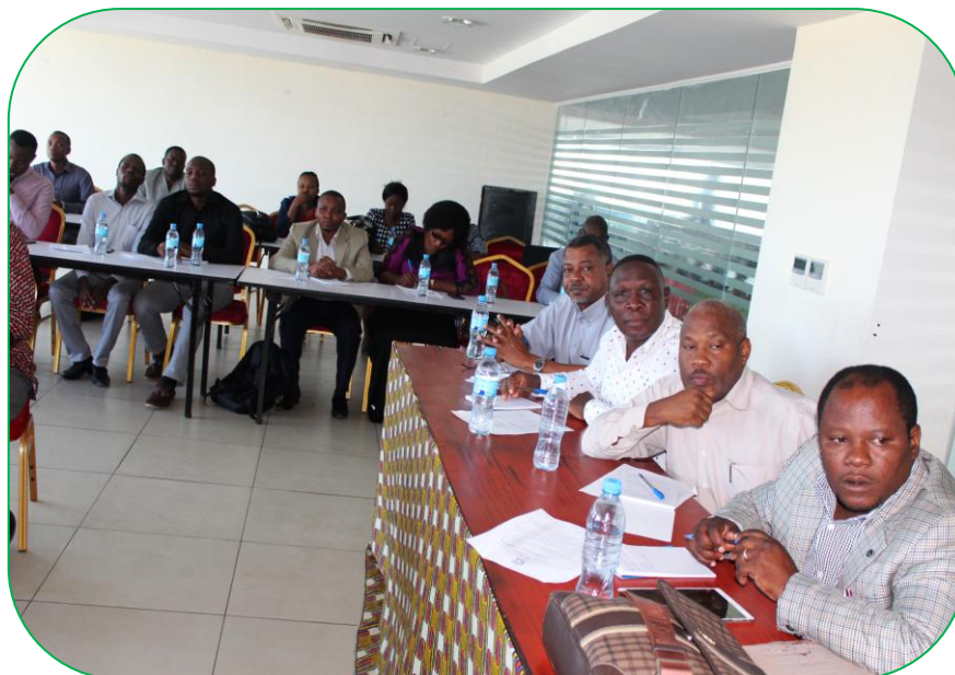
Some of the NBS regional staff including regional statistics Managers listens to presentation from one of the facilitators during the recently held meeting in Dodoma.

“Participants discussed and shared experiences on the implementation of various programmes and also had the opportunity to learn contemporary issues surrounding production and dissemination of official statistics.”