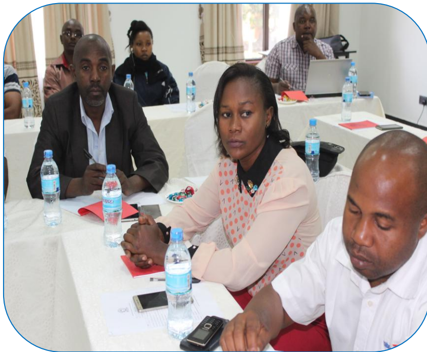
Part of editors and senior reporters follow presentation from one of the resource persons (not in the photograph) during the two-day media workshop on Statistics organized by NBS recently in Morogoro.

Minister Mwakyembe used the occasion to thank NBS management for the support rendered to its ministry in preparation of the ministry's statistics and expressed his optimism that NBS will continue its support in the future.