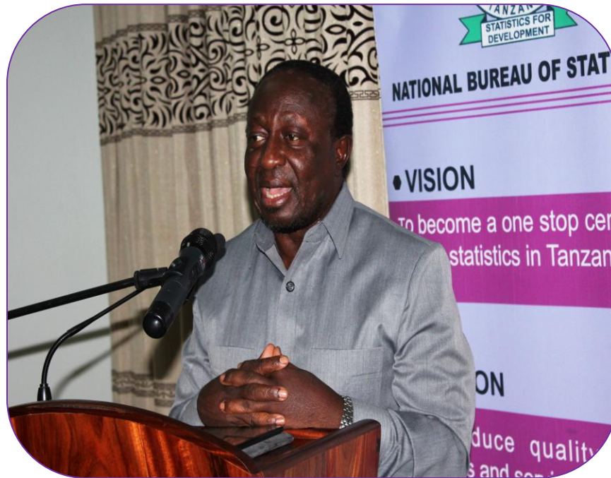
Minister of Information, Culture, Arts and Sports Dr. Harrison Mwakyembe addresses the opening of the two-day media workshop on Statistics held in Morogoro recently.

The Minister of Information, Culture, Arts and Sports, Dr. Harrison Mwakyembe, has commended the National Bureau of Statistics (NBS) for conducting media training on how to write statistics-related stories.