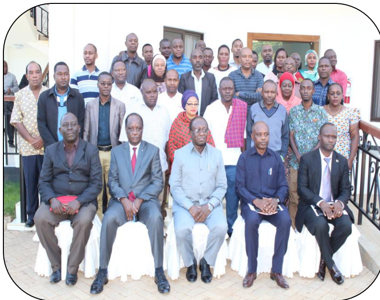
Minister of Information, Culture, Arts and Sports Dr. Harrison Mwakyembe (middle) in a group photograph with editors and senior reporters who attended the two-day workshop on Statistics organized by NBS recently in Morogoro

“It is a purely technical language which is difficult for a normal person to grasp,” said one of the participants and insisted that “simple language is at the heart of any successful communication.”