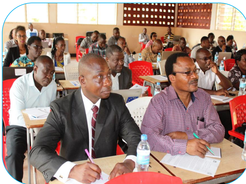
Stakeholders at the workshop on assessing data gap for Five Year Development Plan and Sustainable Development Goals (SDGs) held in Kigoma recently