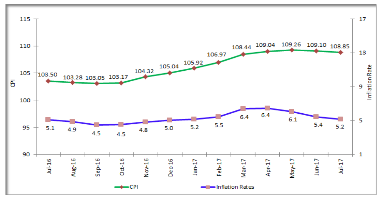
Chart number 1 above explains that; CPI has shown a relatively stable movement of prices from July, 2016 to July, 2017. In addition, Annual Headline Inflation Rates over the same period have shown a stable trend of movement from 5.1% in July, 2016 to 5.2% in July, 2017.