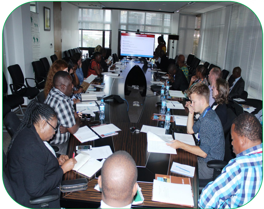
Members of Development Partners Poverty Monitoring Group during their routine consultative meeting with NBS follow proceedings of the recent meeting which was held at AfDB conference hall Dar es Salaam