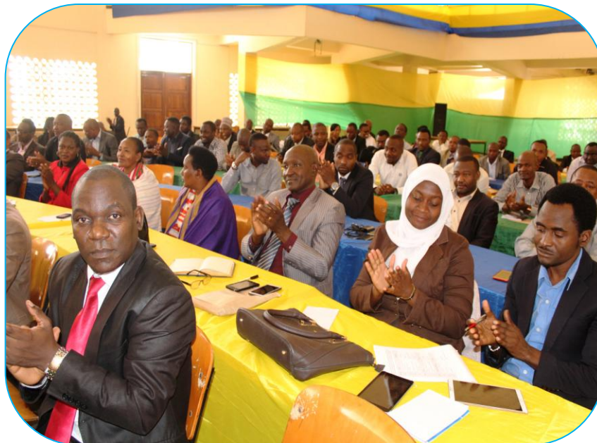
NBS staffs follow presentation on how to handle government/official documents during a one day all NBS staff meeting held in Dodoma.