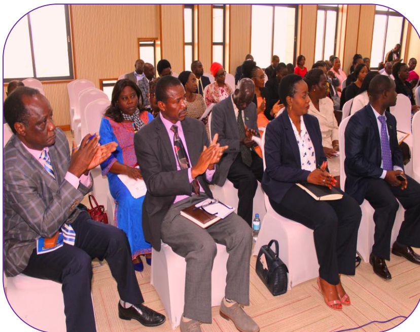
Part of members of NBS Workers' Council applaud guest of honor's speech during the opening of the Third Session of the NBS's Fifth Workers Council