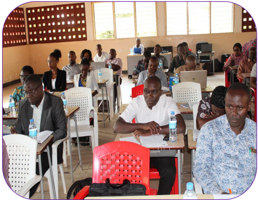
Participants who attended Kigoma sub-national stakeholder's workshop on data to support SDGs and Second Five Year Development Plan (FYDP II) follow discussion at the workshop.

The workshop was the first of a potential series of sub-national data road map process engagements to be convened over the medium term with the key objective being to serve as a platform for sharing of experience, learning about emerging demands for data, and exploring solutions and partnerships for harnessing the data revolution for sustainable development.