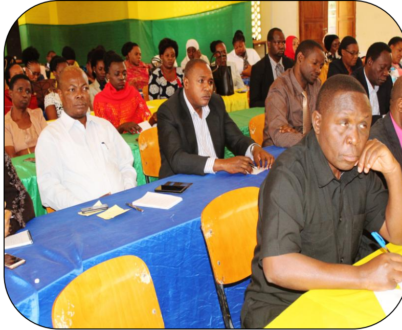
NBS worker's council members listen to Guest of Honor's speech during the opening.

“My ministry issues various circulars and documents regarding staff regulations and emoluments. If one finds it difficult to understand he or she has to ask for clarification from my people at the ministry instead of implementing something which will create misunderstandings, confusion and invite unnecessary complaints which can lead to institutional disharmony,” he emphasized.