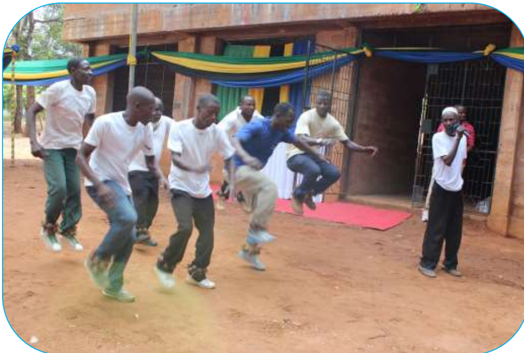
Washirika cultural group from Kigoma Ujiji entertain invited guests during ceremony to laid foundation stone for the construction of a new NBS Kigoma regional office building.