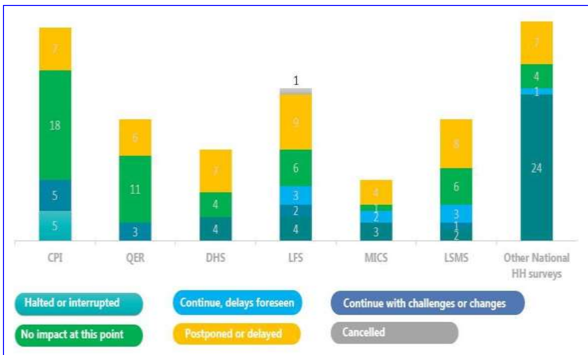
Graphic 1: Number of surveys planned for 2020 by the current status as a consequence of COVID-19

The report says NSOs in the continent have adopted business continuity measures including adjusting to new working hours, limiting staff numbers in the office by adapting a rotational system, working remotely and methodological adjustments.