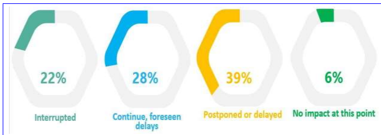
Graphic 2: Status of Population and Housing Censuses activities planned for 2020 as a consequence of COVID-19

government capacities to live up to planned budgetary spending. Statistical offices will consequently suffer this very fact while undergoing the need to disburse financial resources for specifically anti-COVID expenses,” the Report added.