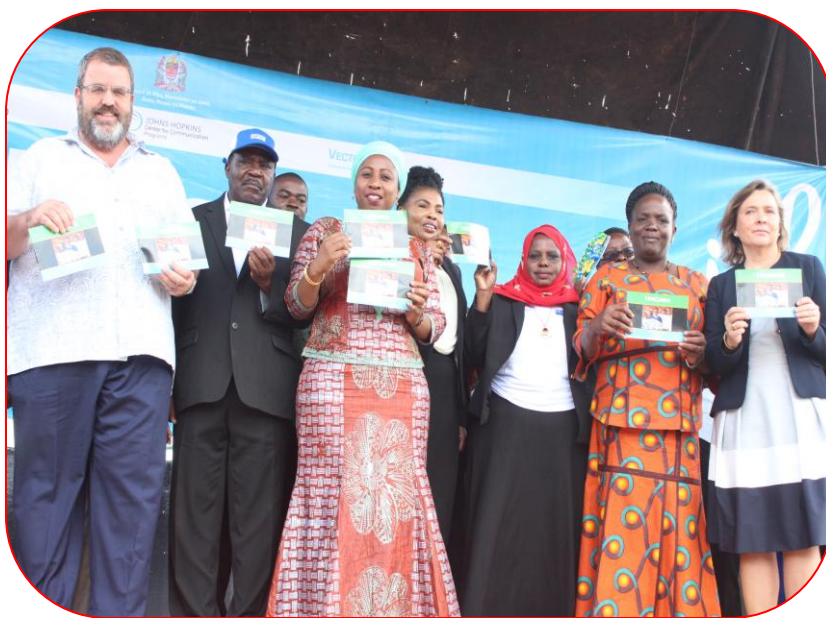
Minister for Health, Community Development, Gender, Elderly and Children Ms Ummu Mwalimu with other dignitaries displaying copies of Report of the 2017 Malaria Indicator Survey which she launched as part of International Malaria Day celebrations in Kasulu, Kigoma.

"The government looks forward to continue creating enabling environment which will foster more partnerships with all stakeholders leaving no one behind in fight against the diseases," said the minister and called everybody to play his or her part wherever he or she is to achieve this national goal.