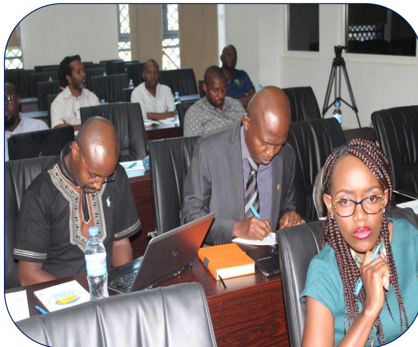
Part of participants at the stakeholders’ meeting on collection and dissemination of Statistics in broadcasting sector follow meeting proceedings.