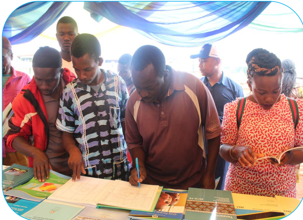
NBS pavilion was one of the attractions at the celebrations to mark the International Malaria Day in Kasulu. In this photograph, Kasulu residents admire various publications displayed at NBS pavilion.