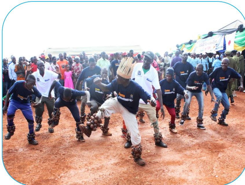
Traditional art group entertain Kigoma residents during celebrations to mark the International Malaria Day celebrations held nationally in Kasulu district.