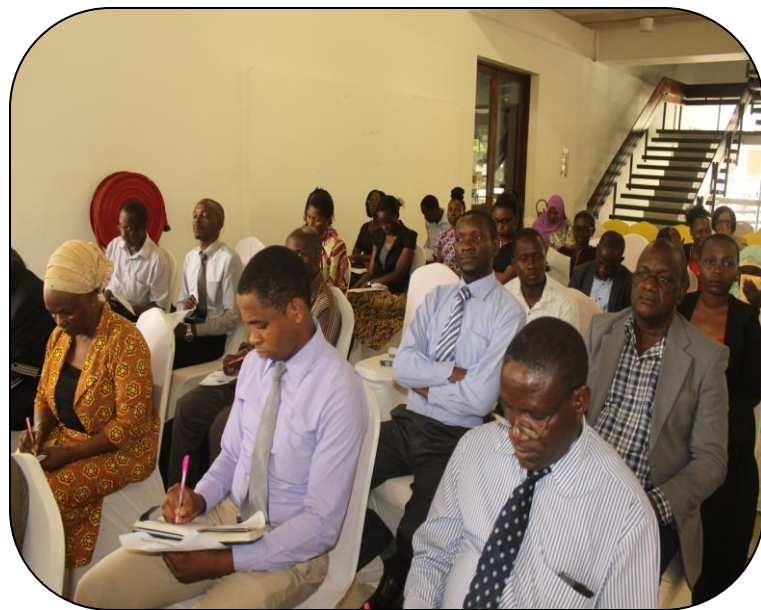
A section of participants who attended the launching of Population Projections Report at National Museum Hall along Shaaban Robert Street, Dar es Salaam.