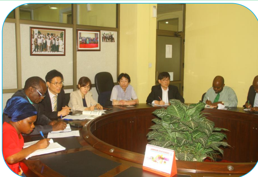
Delegation of Statistics Korea and NBS team in discussion at NBS offices in Dar es Salaam