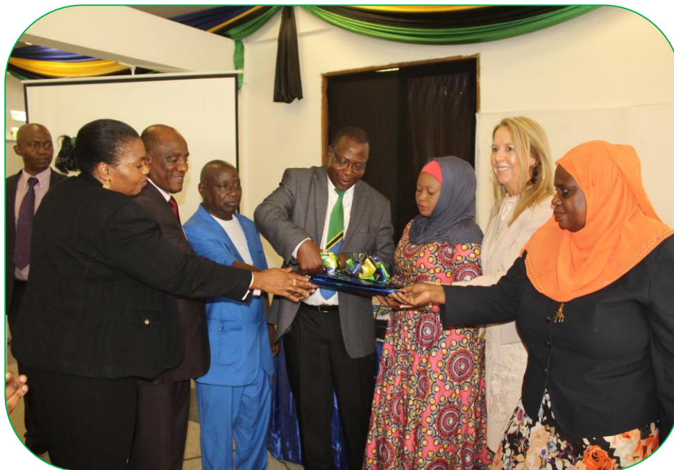
Guest of honour Minister for Finance and Planning Dr. Philip Mpango unveils Report of Tanzania Population Projections for the period of 2013-2035 at National Museum hall, Dar es Salaam

The government has said that it is aware of the challenges that may be brought about by rapid population growth. According to statistics, Tanzania's population is likely to grow from 46.3 million in 2013 to 59.4 million in 2021.