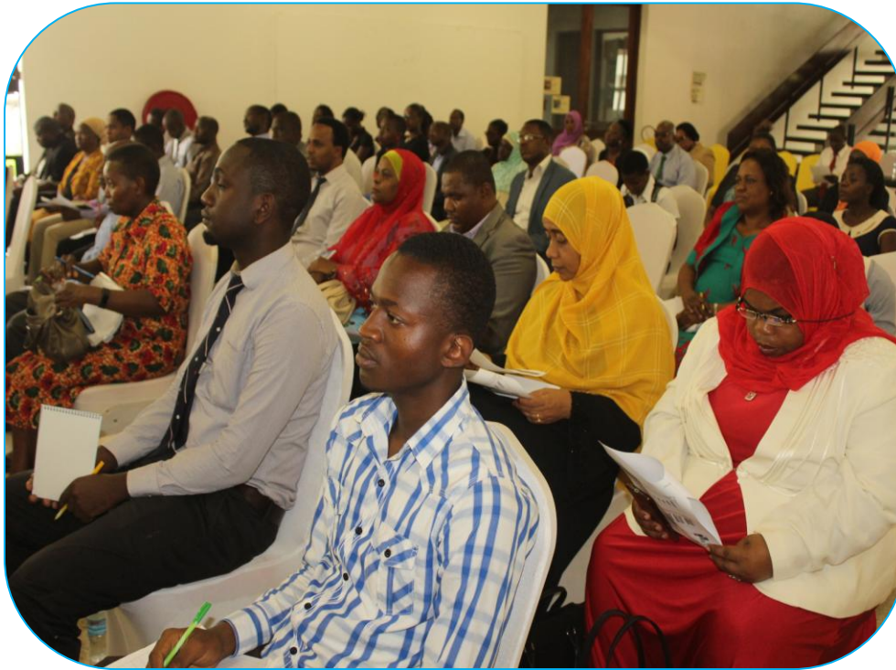
A section of participants who attended the launching of Population Projections Report at National Museum Hall along Shaaban Robert Street, Dar es Salaam follow guest of honor's speech.

against 400,000 deaths yearly. He pointed out the contributing factors to such increase as “high fertility rate, people’s preference to have many children, poverty, culture, religious beliefs and low level of using modern family planning methods.”