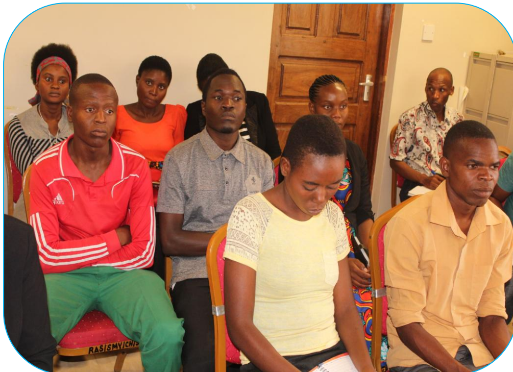
Enumerators of the 2017/18 Households Budget Survey are part and parcel of community mobilisation campaigns team. In this photograph, enumerators in Simiyu attending press conference addressed by Regional Commissioner