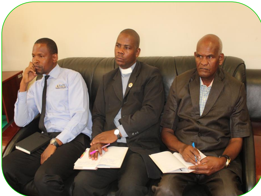
Mobilisation for the 2017/2018 HBS involved various stakeholders. The above photograph shows religious leaders in Simiyu listening to the regional commissioner during a press conference.

Meanwhile, the Simiyu Regional Commissioner, Mr. Anthony Mtaka, instructed all regional, district and local leaders to ensure the survey becomes one of the agenda in all meetings and seminar as strategy to sensitise the public and maximise household participation.