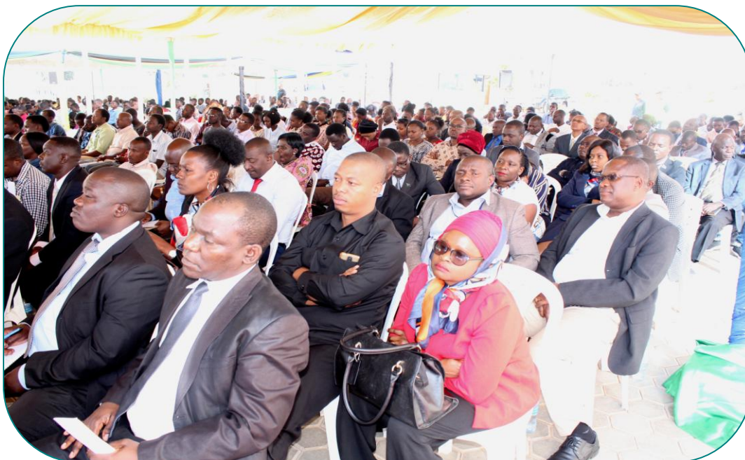
Part of participants to the national dissemination meeting of the Key Findings of 2017-18 Household Survey follow meeting proceedings

She lauded partnership gorged between the UN entity and the entire country statistical system in implementing Women Count Programme which aims at improving production of gender statistics to inform better policy, planning and budgeting.