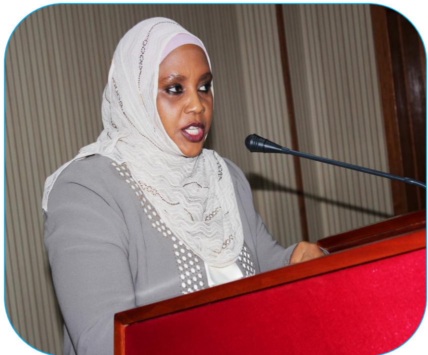
Deputy Minister of Finance and Planning Dr. Ashatu Kijaji addressing NBS Workers Council Meeting held at NBS conference hall in Dodoma.

“You carry on your shoulders, high expectations from the--