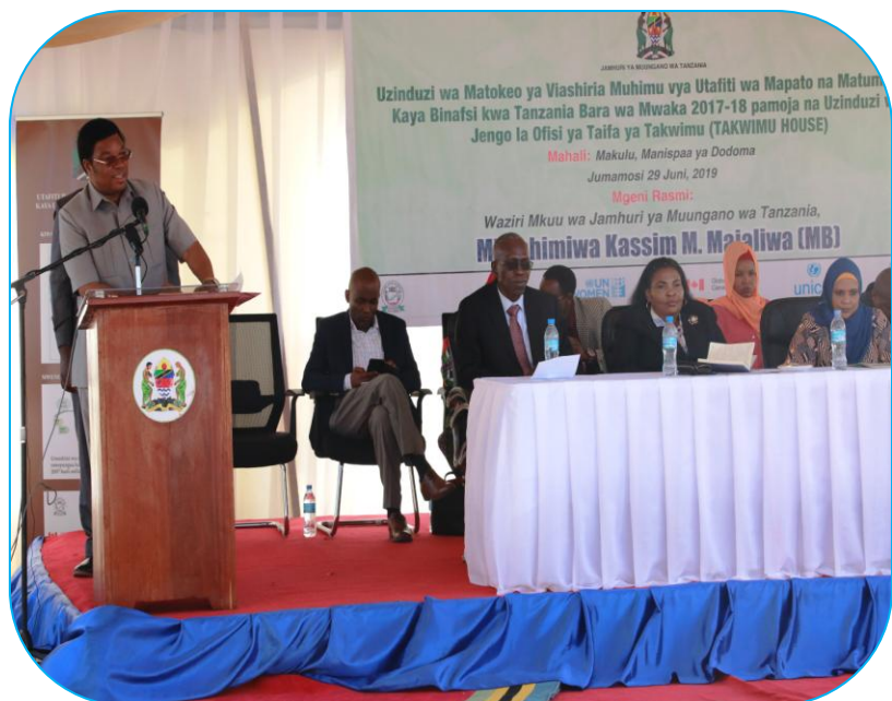
Prime Minister Kassim Majaliwa reading his speech during launching the Key Findings of the 2017-18 Household Budget Survey which was held at NBS offices in Dodoma

The Prime Minister insisted that the importance of quality statistics cannot be over emphasised as it is paramount in achieving the fifth phase government development endeavours to lead Tanzania to medium income country through industrialisation to accelerate economic growth and reduce poverty.