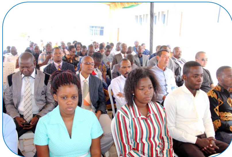
Part of participants to the national dissemination of Key Findings of the 2017-18 HBS

“Access to education and basic services including electricity, water, sanitation and basic infrastructure has improved. This resulted in improvement in human development outcomes and alleviation of --