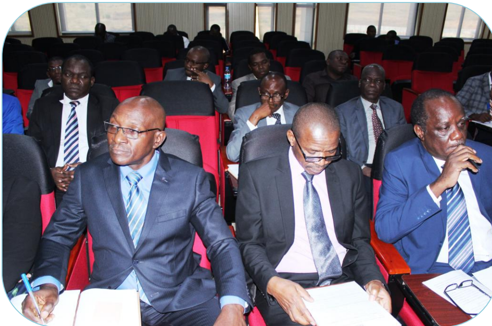
Members of NBS Workers Council and invitees keenly follow proceedings of the meeting