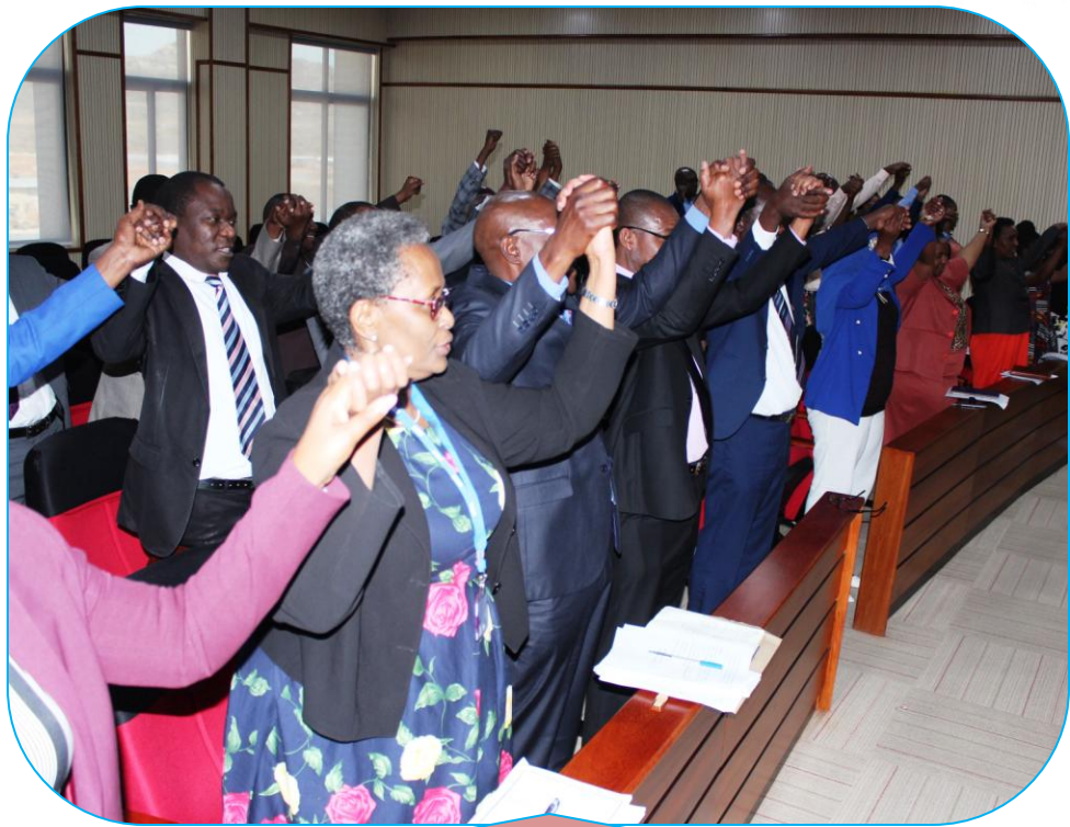
NBS Workers' Council members together raising hands to sing international solidarity song 'solidarity forever' at the beginning of council meeting held at NBS conference hall Dodoma.