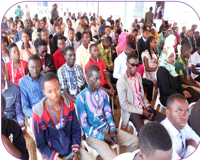
Part of participants to the national dissemination of Key Findings of the 2017-18 HBS

“Through these results, we have realised that there are areas which we have made progress but also there are those which the government and stakeholders have to work together to increase opportunities to our people to be able to reduce basic needs poverty,” he noted.