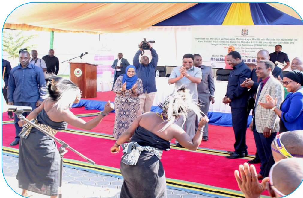
Prime Minister Kassim Majaliwa and Deputy Minister of Finance and Planning Dr. Ashatu Kijaji share light moment with traditional dancers during the inauguration of NBS office building and launching of Key Findings of the 2017-18 HBS

“I call upon all Regional Commissioners to cooperate with NBS to ensure regional profiles are prepared and released in time,”– PM Hon. Majaliwa.