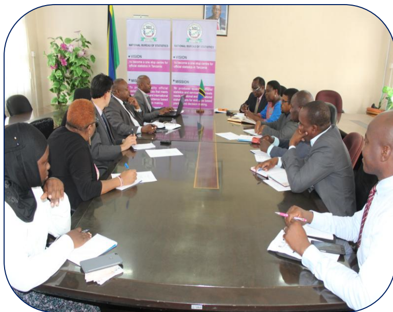
Members of delegation from Mozambique National Statistics Office with their NBS counterparts exchange knowledge and experience about methodologies and technique on how to run Household Budget Survey.

He affirmed that that NBS and Mozambique statistical body will continue to collaborate in various statistical programmes and sharing experiences in conducting the same.