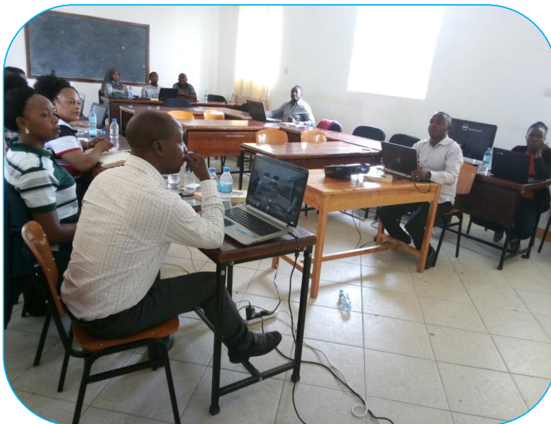
Part of GIS staff from NBS and OCGS during training on application of new technologies in GIS as part of preparations for the coming Population and Housing Census.

In its efforts to maximise application of new technologies during the coming Population and Housing Census, Tanzania through funding from UNFPA recently conducted training session for the NBS and OCGS staffs in charge of geographical information system (GIS).