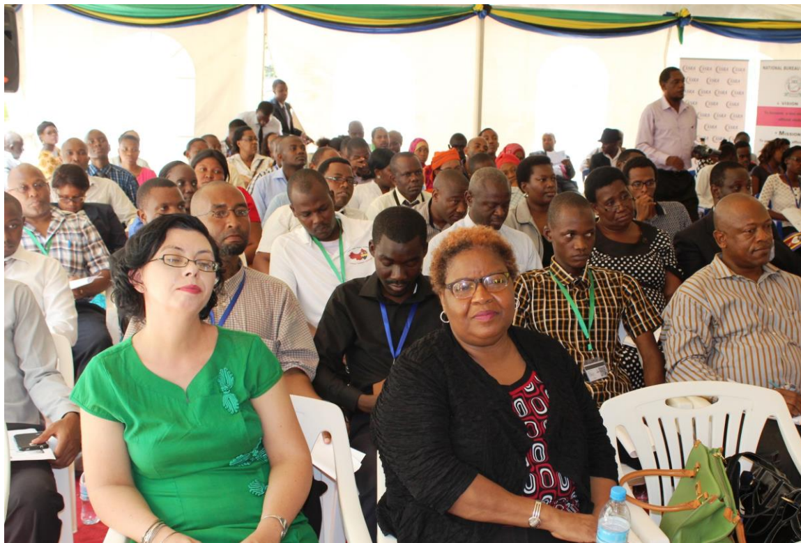
Participants listening to the presentation during the celebration of African Statistics Day in Dar es Salaam on 23 rd November, 2015.