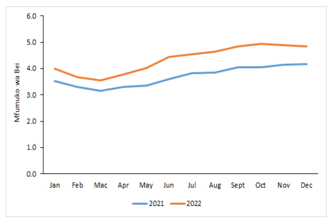
Chart 3: General Movement of National Inflation Rates in 2021 and 2022

Chart 3 shows patterns of inflation trends in 2022 compared to 2021. Overall, the inflation rate shows a similar pattern over the period (January to December). Furthermore, the inflation tare shows a stable trend ranging between 3.2% and 4.9% over the two periods (January 2021 to December 2022).