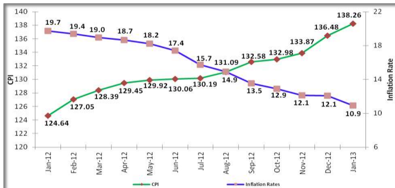
Chart 1: Movement of National Consumer Price Indices (NCPI) and Inflation Rates from January, 2012 – January, 2013. (September 2010 = 100)

Chart number 1 above shows that; during the period of January, 2012 to January, 2013 CPI have shown a steady increasing trend in prices of commodities. Annual Headline Inflation Rates over the same period have shown a decreasing pattern from 19.7% in January, 2012 to 10.9% in January, 2013.